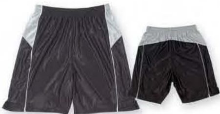
B604 Dallas Style Short