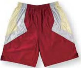
B258 Short ★ Elastic Waistband w/Drawstring ★ Diamond Side Pattern