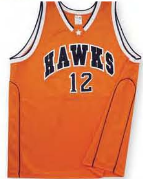
B206 Syracuse Style Jersey