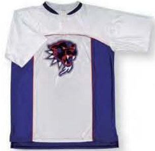
B449 Shooter Shirt ★ Knitted Neck Trim ★ 1/4 Zipper