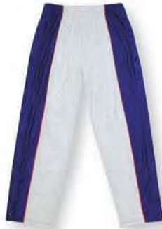
B459 Pant ★ Elastic Waistband ★ Full Dome Tearaway