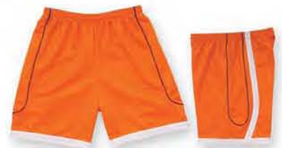
B372M Syracuse Style Short