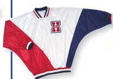
B487 Warm-up Jacket ★ Knitted Neck, Cuff, Waist ★ 1/4 Zipper