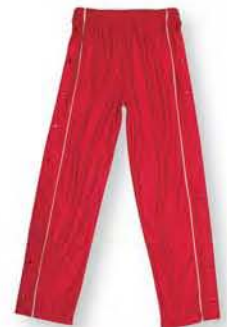
B704 Pant ★ Elastic Waistband ★ Full Dome Tearaway