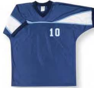
B381 Shooter Shirt ★ Knitted V-Neck and Arm Trim