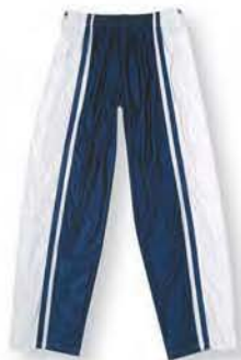
B496 Pant ★ Elastic Waistband ★ Full Dome Tearaway