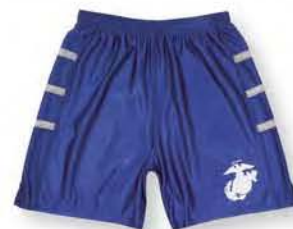
B431 Short ★ Elastic Waistband w/Drawstring