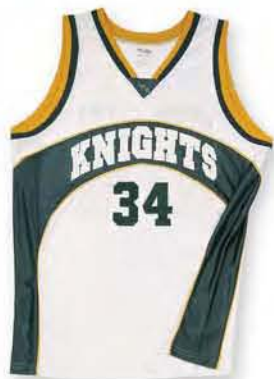
B668 Seattle Style Jersey