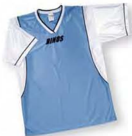
B700 Shooter ★ Knitted Crossover Neck