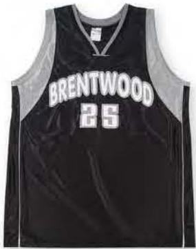
B605 Dallas Style Jersey