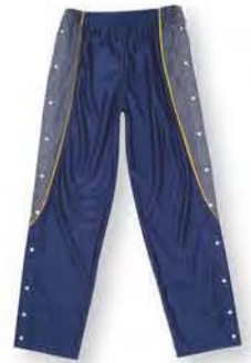
B499 Pant ★ Elastic Waistband ★ Full Dome Tearaway