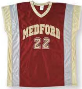
B363 Shooter Shirt ★ Self Trim V-Neck