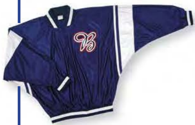
B486 Warm-up Jacket ★ Knitted Neck, Cuff, Waist ★ 1/4 Zipper Front