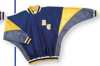
B489 Warm-up Jacket ★ Knitted Neck, Cuff, Waist ★ Zipper Front