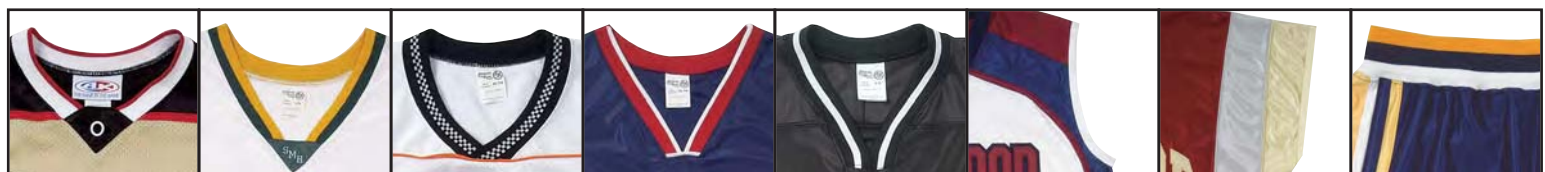
Diamond Insert Triangle Insert Jacquard Knit Rap Neck Square V-Neck Muscle Cut Capped Sleeve Knit Waistband