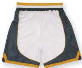
B667 Seattle Style Short