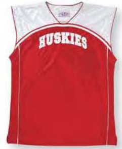
B703 Shooter Shirt ★ Self Fabric Collar ★ Armhole and Collar have Piping Tips