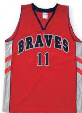
B426 Toronto Style Jersey