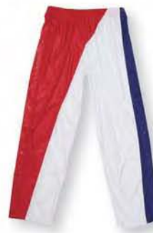
B491 Pant ★ Elastic Waistband ★ Full Dome Tearaway