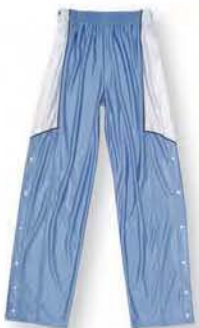
B701 Pant ★ Elastic Waistband ★ Full Dome Tearaway